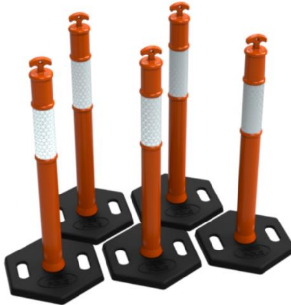
TP200 - O – Orange Mobi Pole